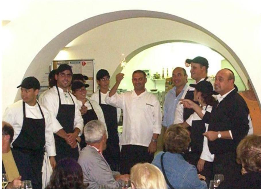
Hadassah Associates with members of the HCJ Culinary Arts Department.